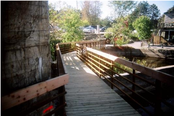
Riverwalk Bridges Opening Day 2005

He has championed the Riverwalk project, since its 2002 beginning, and has continued to advocate ongoing maintenance and further expansion.